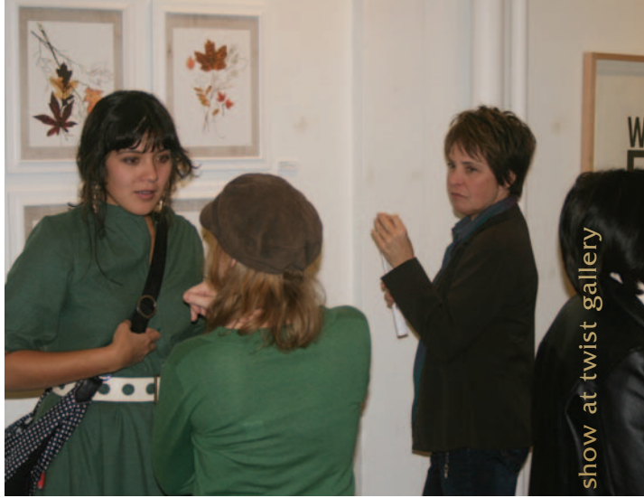
show at twist gallery group